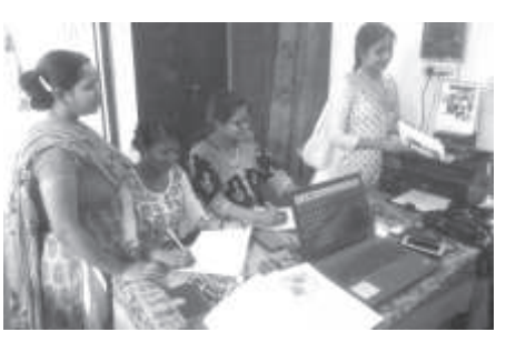
department of Museology, university of Calcutta are sent here for Internship of three (3) months after obtaining their certificates.

This year too four (4) internees were sent from February 2, 2017 and they have successfully completed their Internship on April 30, 2017.